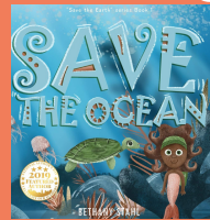
SAVE THE OCEAN BY BETHANY STAHL